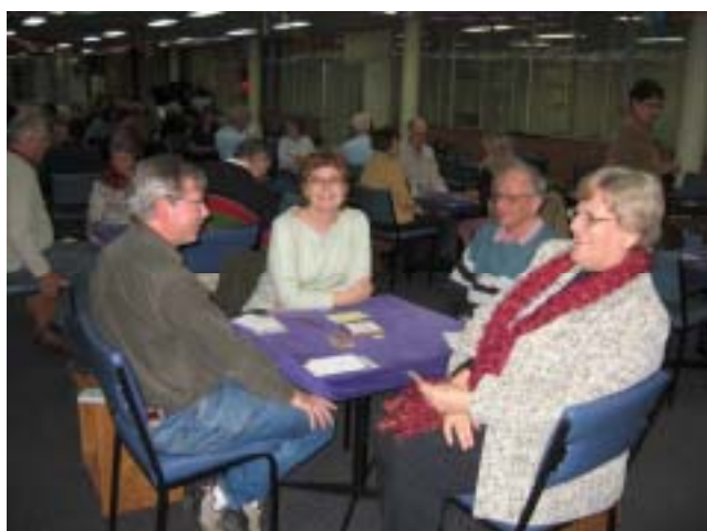
A Happy Group of Monday PM Players