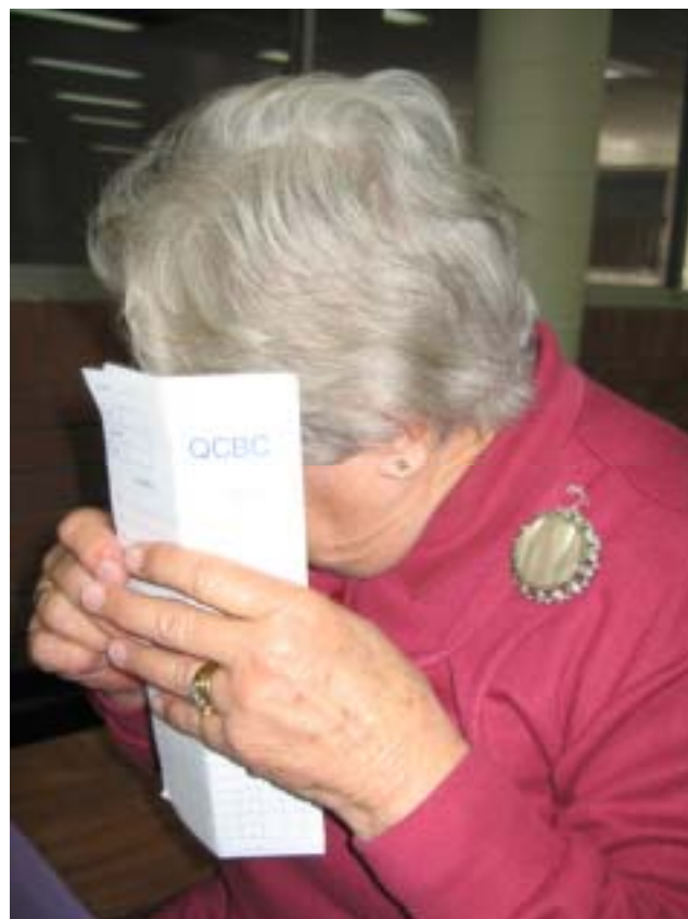
Who is hiding behind the QCBC score card?