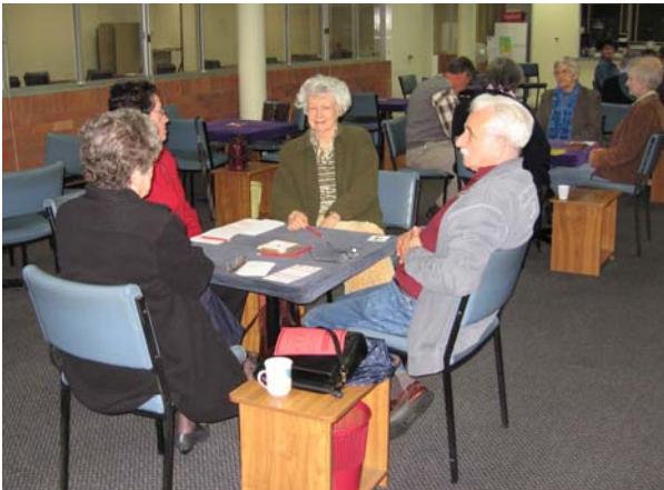
A Monday night table ready to start play

STILL WANTED 3 MEN AND A TRUCK to collect a fridge please.